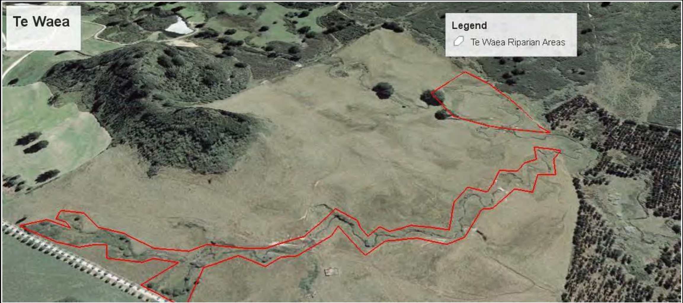
Te Waea Riparian